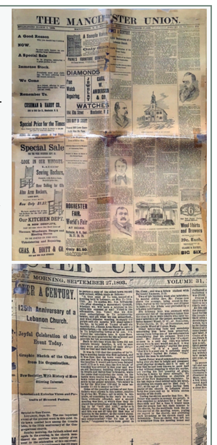
Manchester Union, 27 Sept 1893

We will mark our 250th anniversary in various ways over the coming months. We will have guest preachers. We will get