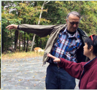
Balch Hill and Pine Park Sunday, September 20