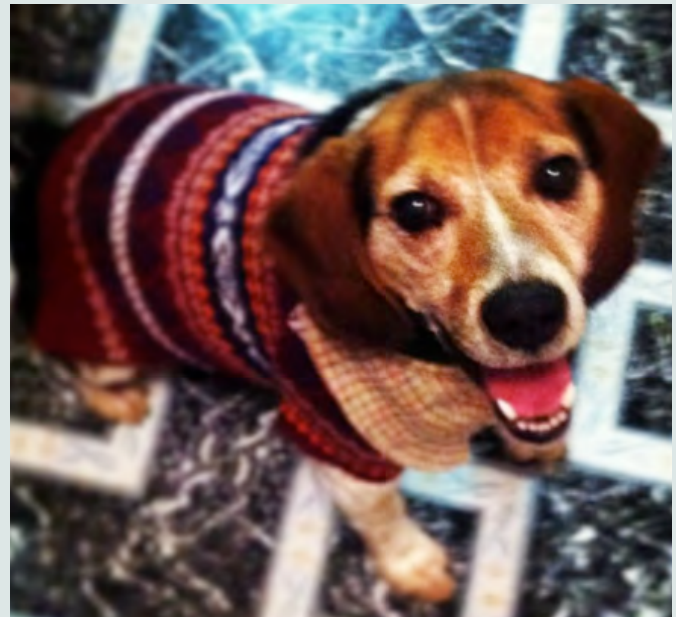
Above: Shunka, whose name is Sioux for “dog.”

I am doing a musical that I wrote, entitled A Series of Unfortunate Sneezes: The Truth Behind the Big Bad Wolf . Based on Little Red Riding Hood and the Three Little Pigs, it’s a contemporary story with modern pop and rock music, and it