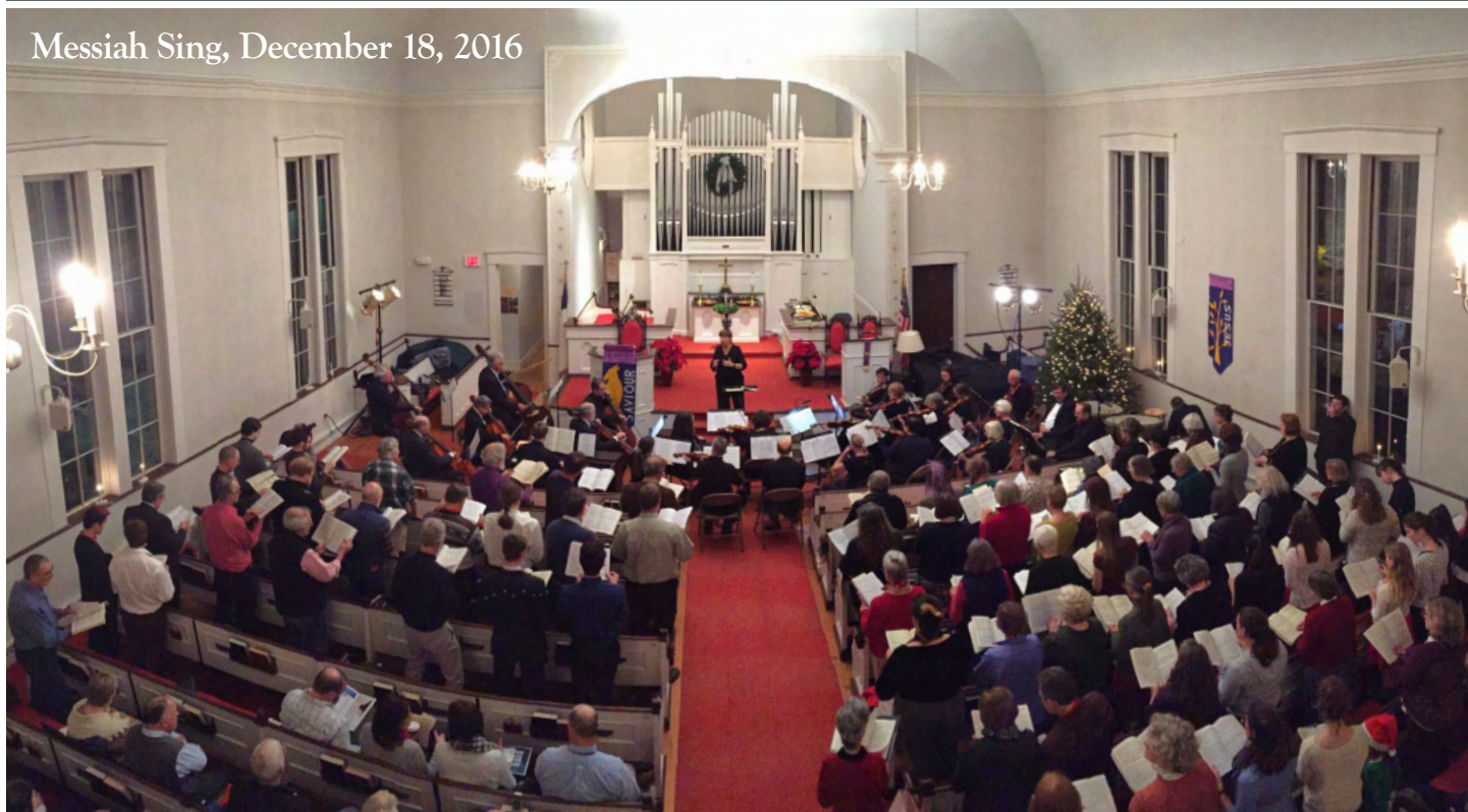
Messiah Sing, December 18, 2016

Enjoy the wealth of musical talent possessed by the faculty of our excellent local music school.