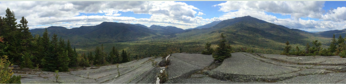
Don't miss this incredible opportunity to build community and faith amidst God's creation!