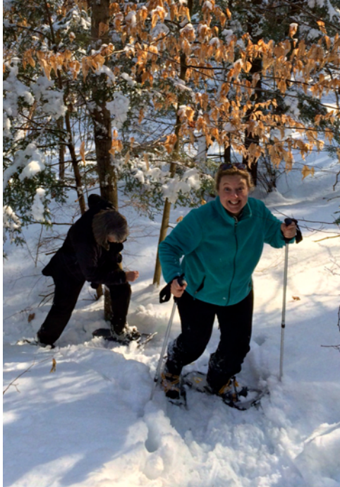
FIRE and ICE Sunday, February 22