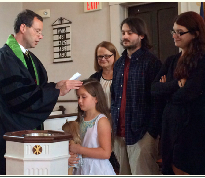
Children's Sunday! June 12, 2016