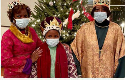
A Mini Messiah Sing......6