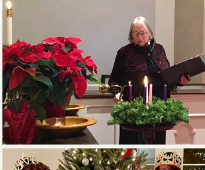
Christmas in Person......5