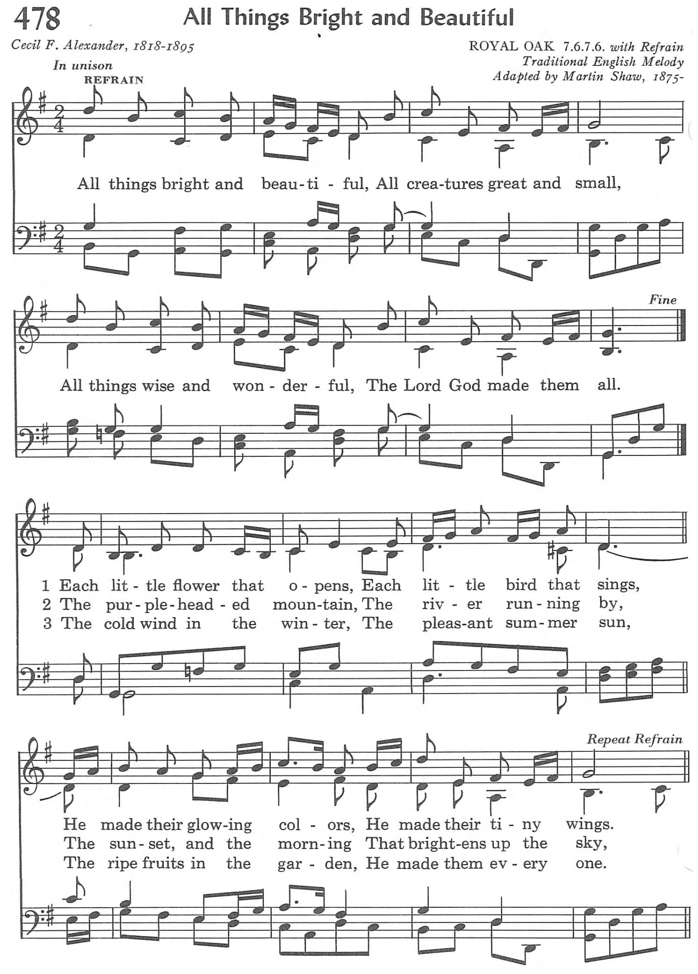
Hymns used and reproduced under license 734395-A from OneLicense, 4/13/2024-4/12/2025.