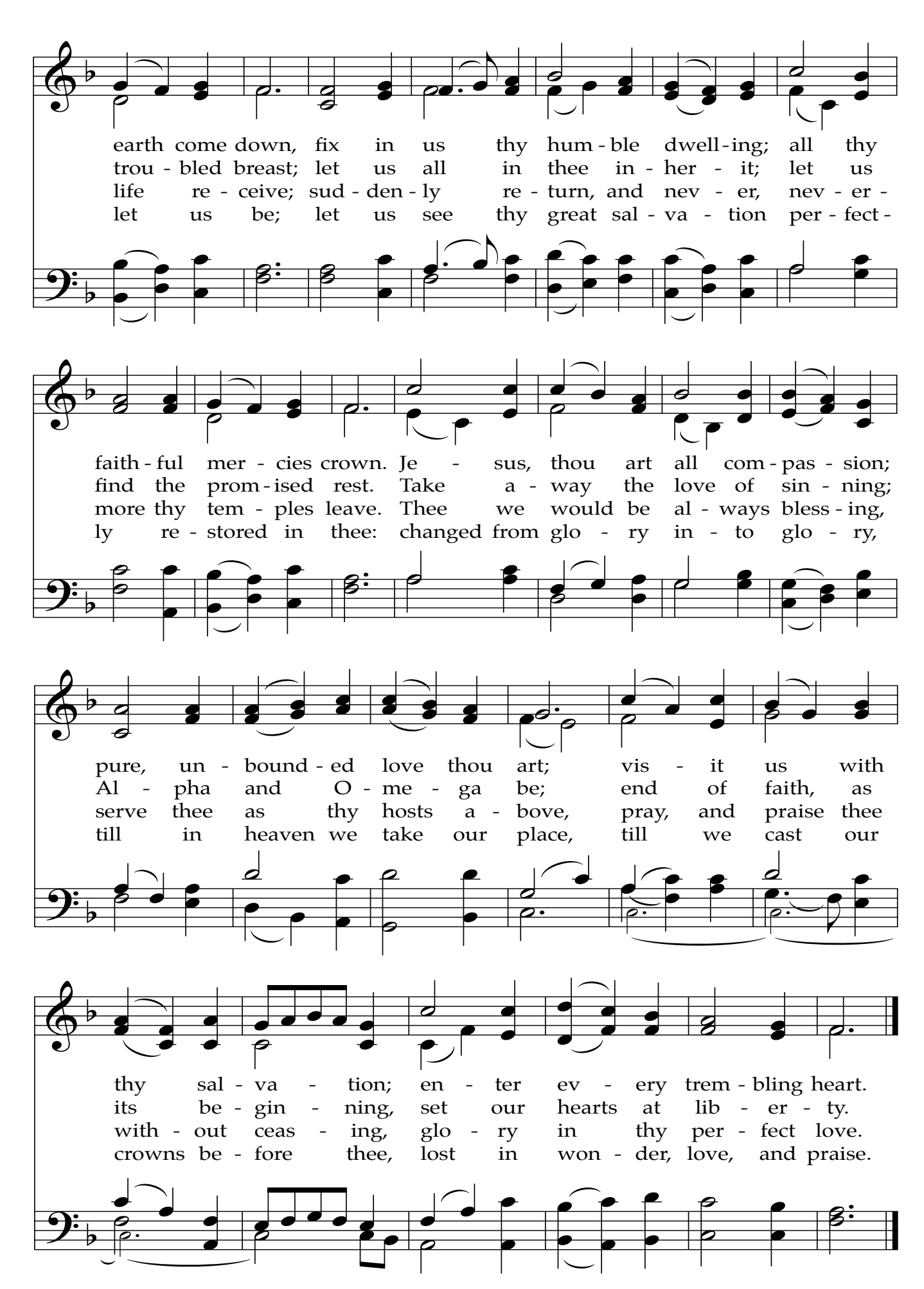
Hymns used and reproduced under license 734395-A from OneLicense, 4/13/2022-4/12/2023.