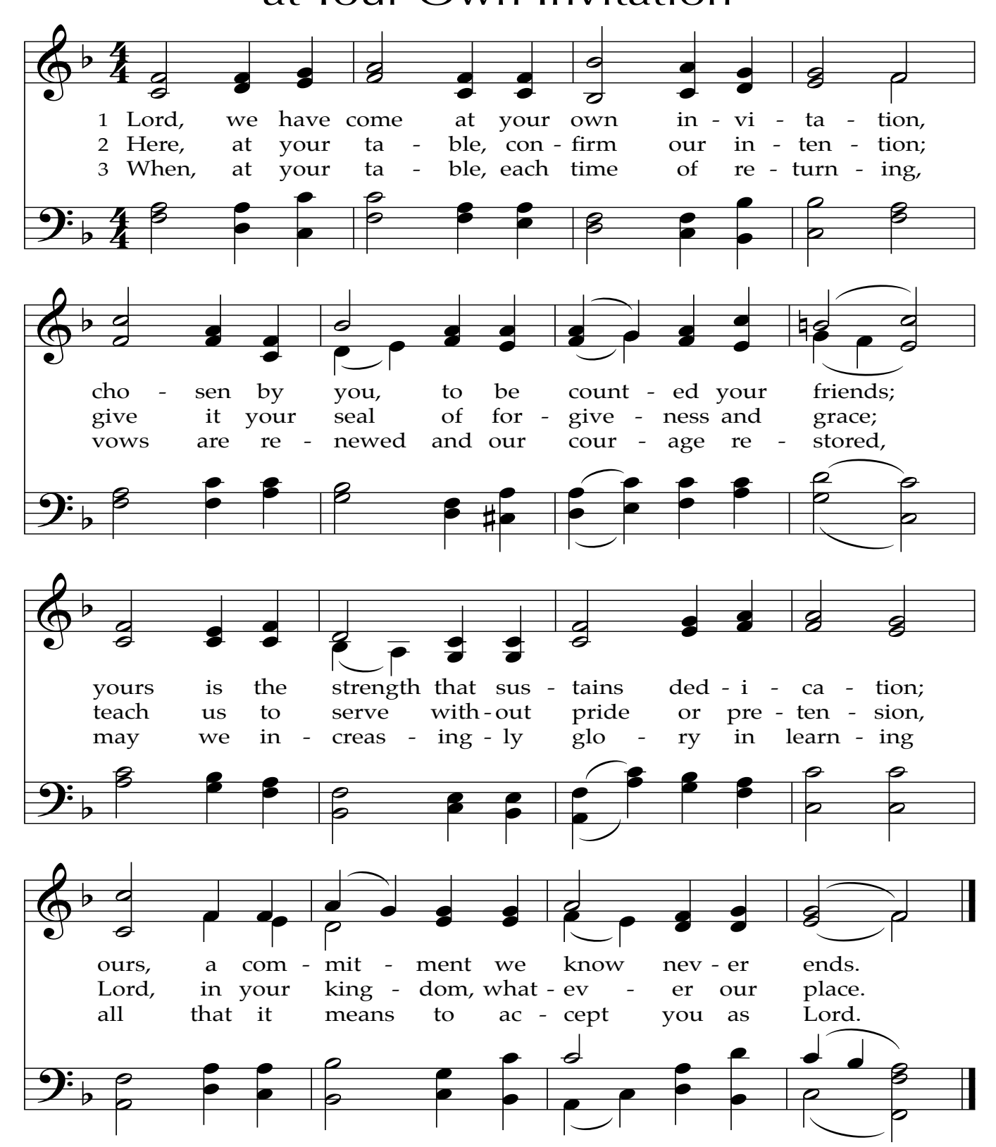
St. Augustine spoke of eucharist as "the repeatable part of baptism," and this hymn reminds us that each time we share in the Lord's Supper we are renewing our baptismal vows. The text is set to a tune that dates to the transition between plainchant and modern tonalities.