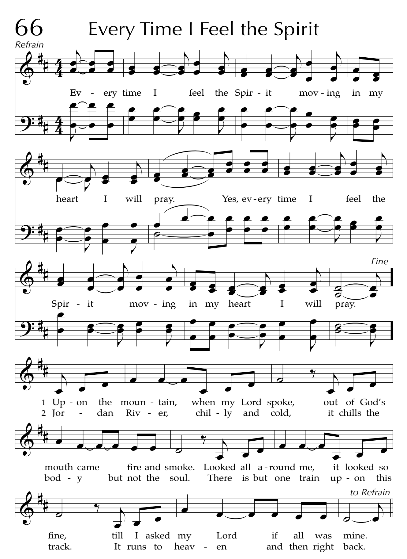
Like many African American spirituals, this one mixes the language of biblical narrative with veiled but effective allusions to the hope of escape from slavery, either by crossing rivers into free states or by participating in organized efforts like the Underground Railroad.